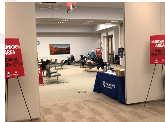
Photo: PVMC's Vaccination Clinic Adams County Government Center

North Central Region EM and State Coordination Access and Functional Needs Coordination Adams County Emergency Manager's Coordination TCHD/ EM coordination PVMC COVID-19 Coordination updates TCHD/Adams County Elected Official updates Adams County Regional Council of Governments Coordination NCR Hospital/ EM Coordination