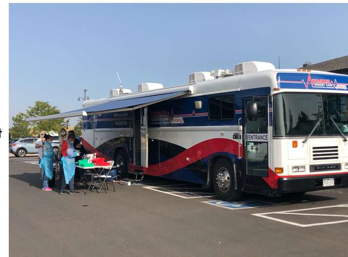
Photo: Advanced Urgent Care Testing Unit

North Central Region EM and State Coordination Access and Functional Needs Coordination Adams County Emergency Manager's Coordination TCHD/ EM coordination PVMC COVID-19 Coordination updates Adams County Regional Council of Governments Coordination NCR Hospital/ EM Coordination