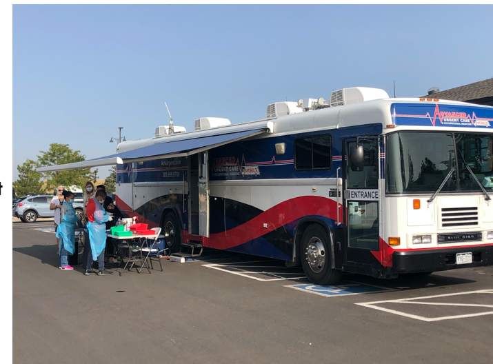
Photo: Advanced Urgent Care Testing Unit

North Central Region EM and State Coordination Access and Functional Needs Coordination Adams County Emergency Manager's Coordination TCHD/ EM coordination PVMC COVID-19 Coordination updates Adams County Regional Council of Governments Coordination NCR Hospital/ EM Coordination